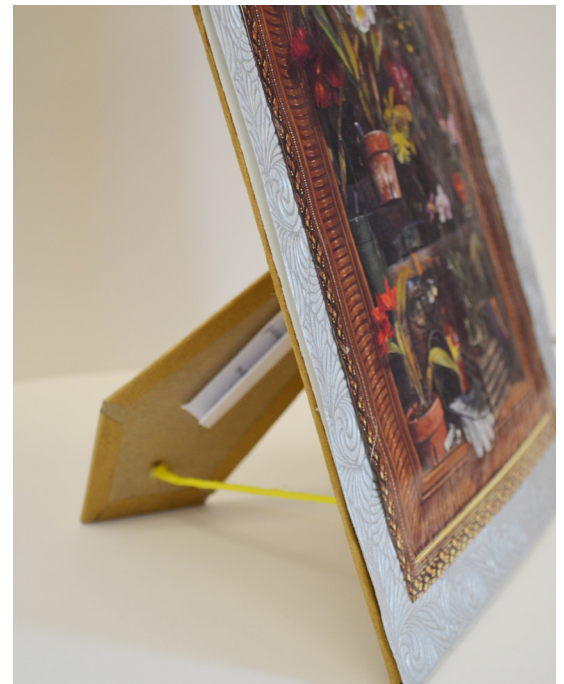
Hidden message under the stand