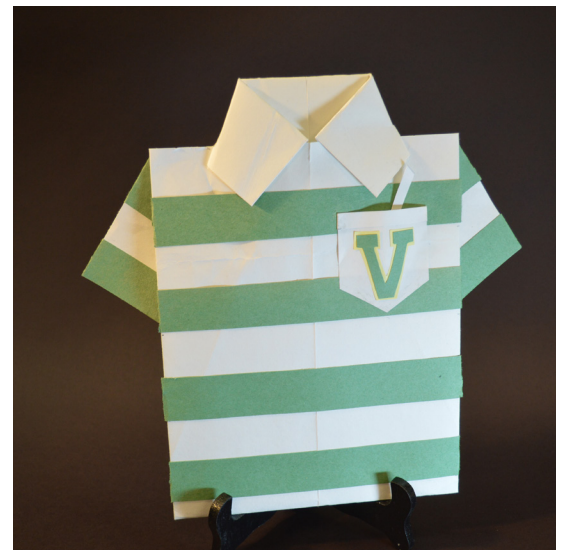
Rugby jersey for sibling with hidden message in pocket.